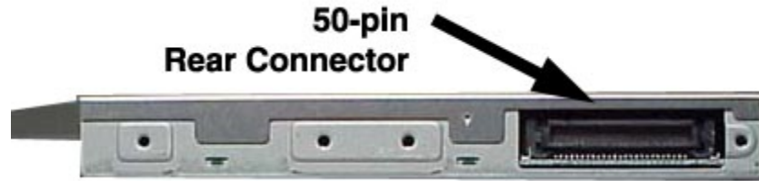
Figure 1. SD-R2612 DVD Writeable Drive Rear Panel – Connector

ATAPI Connector A 50-pin ATAPI interface connector is found at the rear of the SD-R2612 CD-RW/DVD-ROM Combo drive. Connecting cable should use Japan Aviation Electronics Industry Limited KX14-50Series L or equivalent connector.